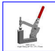
AMT-14114 Angle Clamp, 45° VEE 119 x 78mm