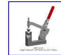
AMT-14118 Angle Clamp 45° x 45° Knife VEE 119 x 78mm