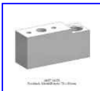
AMT-14135 Pin Block NAAMS Style 75 x 35mm