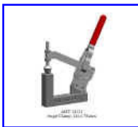
AMT-14111 Angle Clamp 116 x 78mm