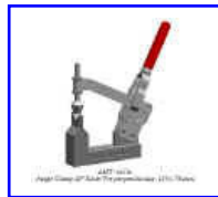
AMT-14117 Angle Clamp 45° VEE (Inline) 119 x 78mm