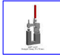
AMT-14109 Straight Clamp 95 x 95mm