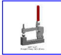
AMT-14107 Straight Clamp 140 x 45mm