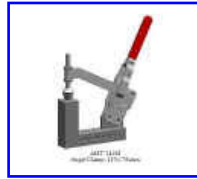
AMT-14108 Angle Clamp 119 x 78mm