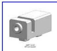
AMT-14140 SPC Set Master