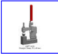
AMT-14106 Straight Clamp 95 x 45mm