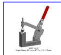
AMT-14115 Angle Clamp 2, 45° VEE 119 x 78mm