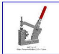
AMT-14112 Angle Clamp with Shim 119 x 73mm