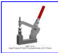
AMT-14116 Angle Clamp, 45° VEE (Perpendicular) 119 x 78mm