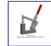
AMT-14120 Angle Clamp with Threaded Bore 120 x 78mm