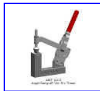
AMT-14113 Angle Clamp, 45° VEE 90 x 78mm