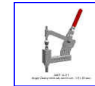
AMT-14119 Angle Clamp with Adjustable Screw Net 119 x 55mm